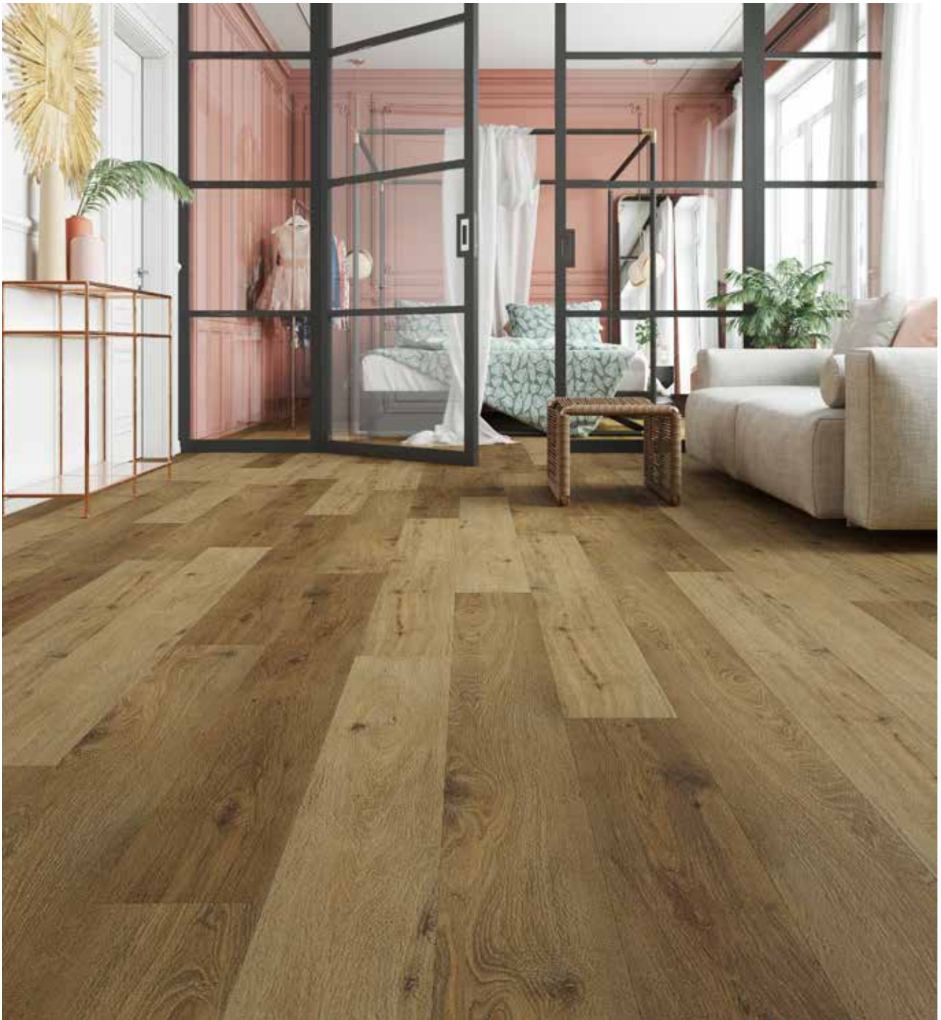
Hybrid: Golden Ash